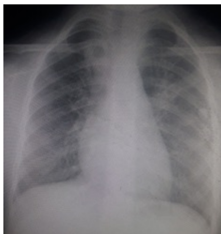
Figure 1: Frontal A chest radiography showing thoracic distension with bilateral alveolar opacities

In the present paper, we report one of the first Tunisian critical pediatric cases, a 6-year-old girl with an atypical ARDS secondary to SARS-CoV2 to inform pediatric providers on the clinical course and management considerations as this pandemic continues to spread.