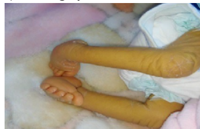
Figure 1 : arthrogrypose

fifth child to consanguineous healthy parents. He was born at term after an uneventful pregnancy, weighing 3300 g (50th percentile). There was no maternal history of gestational diseases, neither was there any positive maternal infection serology or drug intake. However, there was a history of death of two brothers respectively at the age of 40 days and 4 months; they presented neonatal jaundice and skeletal abnormalities, whereas, his two sisters were healthy. At birth, arthrogryposis was noticed, but no evident other malformations. On admission, the clinical examination revealed dysmorphism (low set ears, arched palate, retrognathism), ichthyosis, arthrogryposis (Figure.1), jaundice with normal colored stools, but no hepatomegaly.