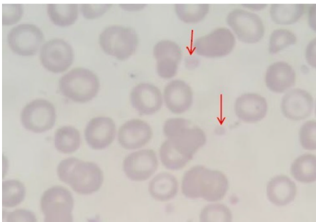
Figure 2 : pale appearing platelets

After initial investigations, he was discharged and was readmitted at 30 days of life when he presented a mild dehydration and growth failure. His weight was 2.6 kg (-2,5DS), his height was 49 cm (-2DS). We noticed a bleeding tendency during blood sampling. The platelet count was normal, however platelet morphology was abnormal. In fact, the blood smear showed pale-appearing platelets consistent with gray platelet syndrome (Figure.2). Platelet Function Analyser (PFA100) was prolonged.